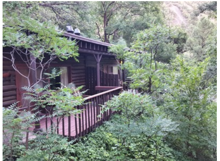
Morning view of a patio