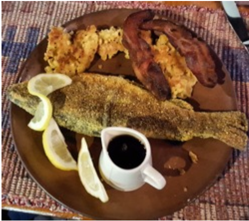
Trout for breakfast

The breakfast menu is not extensive, but open with your choices from many items which are changed daily. The only item I recommended to everyone was the apple cider. That was a given because it is freshly pressed (“not squeezed” – thanks, Brenda) on the premises using all the beautiful varieties of apples we saw growing outside some of our cabins. I drank three glasses – YUM! For my breakfast, I selected the whole trout which comes from the trout farm just down the highway. Everything was good and with so much on our plates, none of us at our table finished our breakfast.