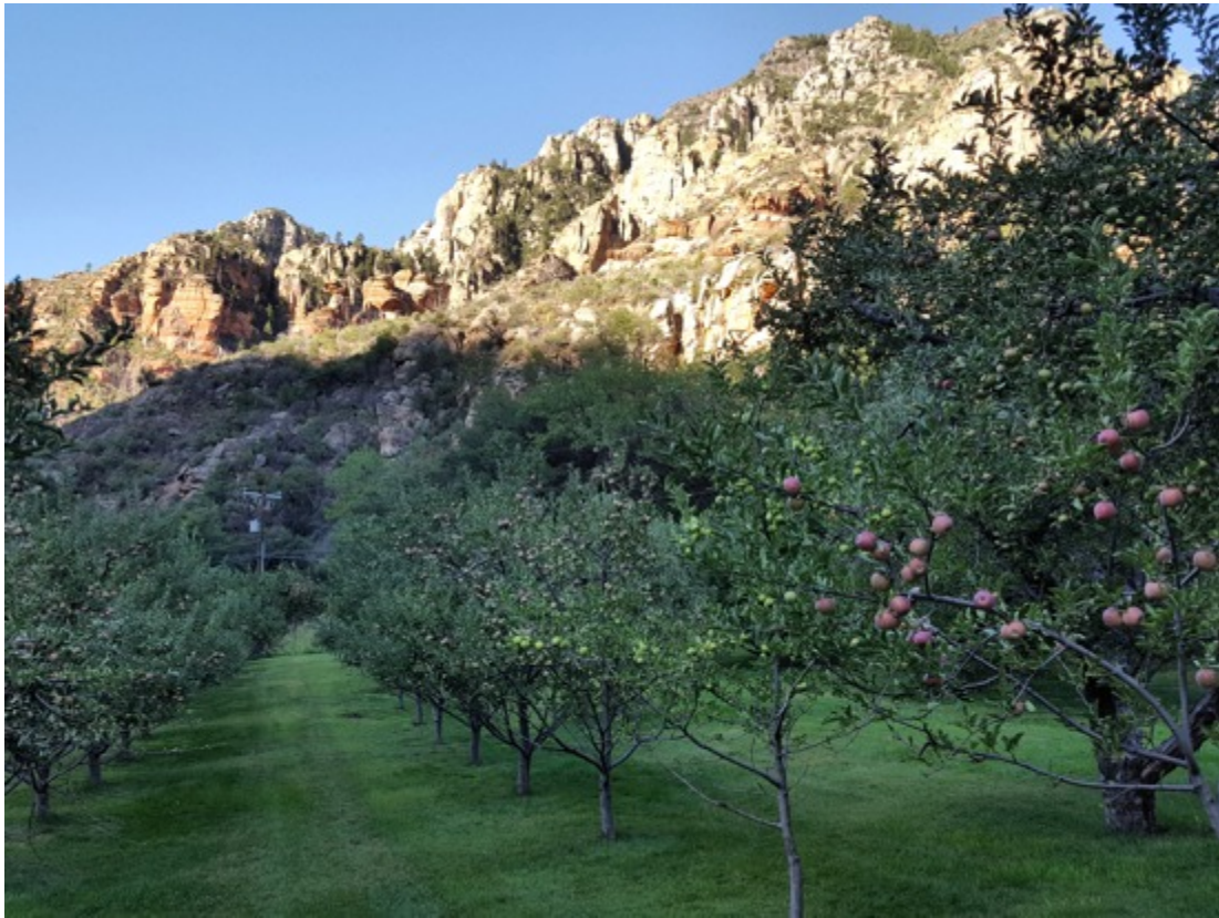
The orchards in the morning