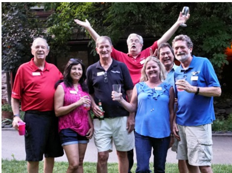
ARE WE HAVING FUN YET?