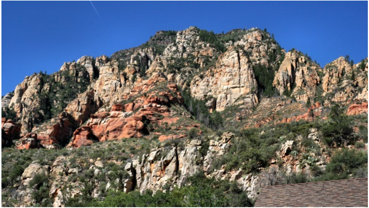
A view in Oak Creek Canyon

After passing Slide Rock State Park, we arrived at the cabins and turn left onto an entrance road with a section doubling as a small dam with a shallow, but wide stream rippling over it. I had to stop and wave back at all the wide-eyed kids and their astonished families at this watering hole location, as they pointed and waved at us. Everyone was so happy to see us. Ok, I know, it's really not us, it's about our cars. But, during this trip, I fantasized that I've been recognized as a famous Crazy Asian, even if I am not Rich.