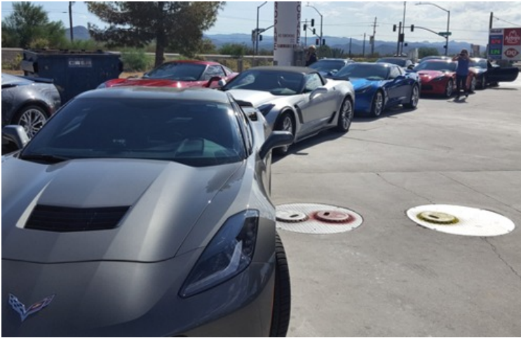
Double row of Vettes at the Mobil station

Smile! , everyone...and start getting used to all this attention.