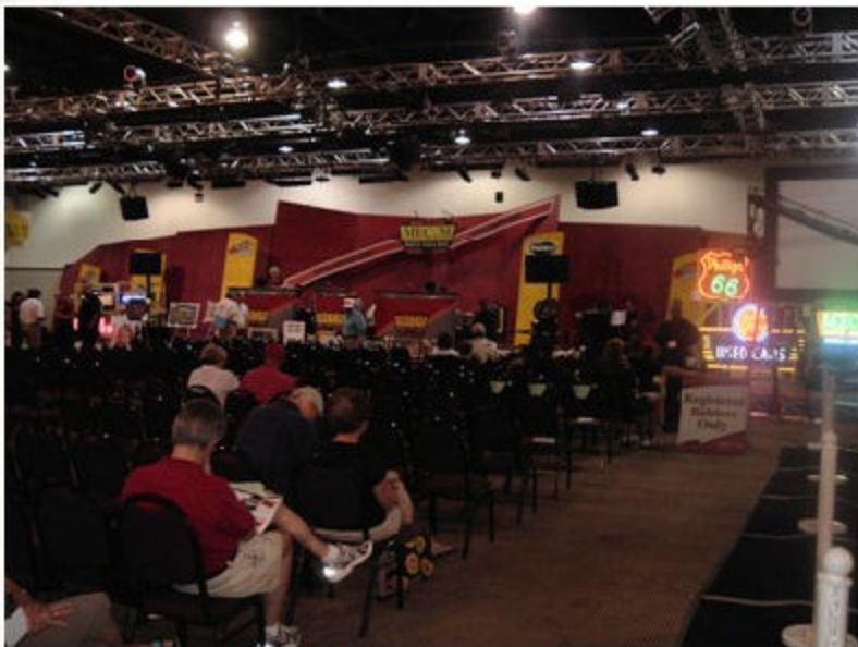
Bidders gather for the Corvette auction on Friday.