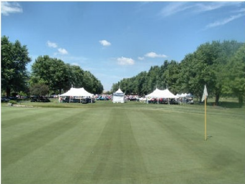
A view of one of the fairways and green with cars awaiting the judging competition.

most a thousand Corvettes parked along fairways, near ponds and lakes, and in the middle of these tree-lined fairways! No wonder it is also called "America's Most Beautiful Corvette Show." Weather for the four-day event (June 25-28) was sunny and hot, with temps over 90 degrees and humidity over 80% (made one appreciate that "dry" heat in Arizona!)