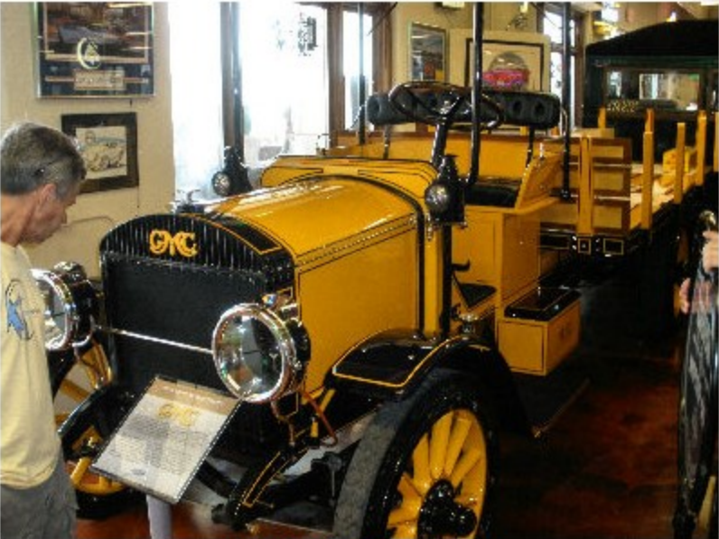
1916 GMC Stake Truck

This looks like the truck that was at the Barrett Jackson Auction last January. Anyone know if it's the same one?