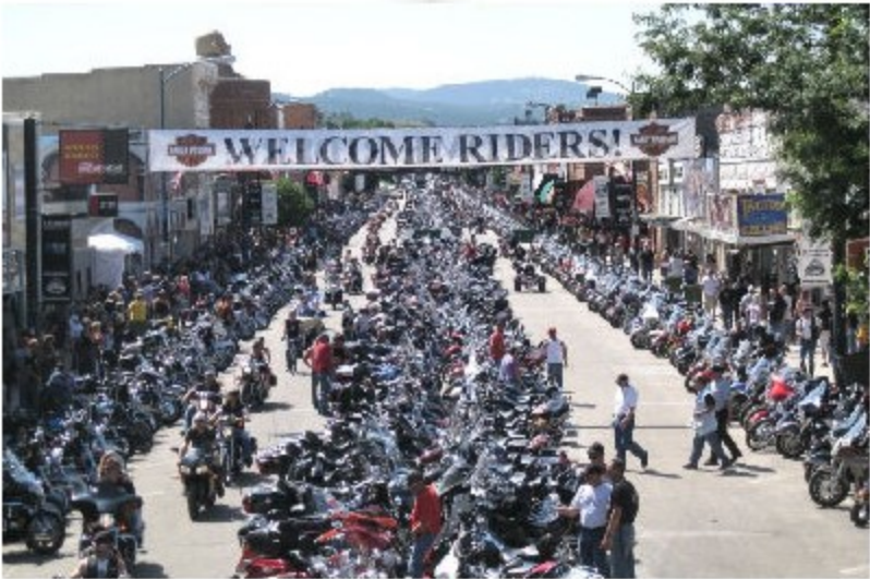
Just a few bikes in Sturgis, at left