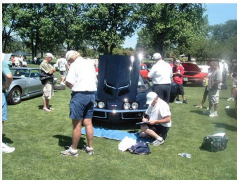
A four-person judging team determines whether a car is Certified Bloomington Gold.

two items may not result in major point reductions, most owners appreciate the knowledge and feedback provided by the judges, and there are generally few disagreements and the judges have all the necessary documentation to substantiate their findings.