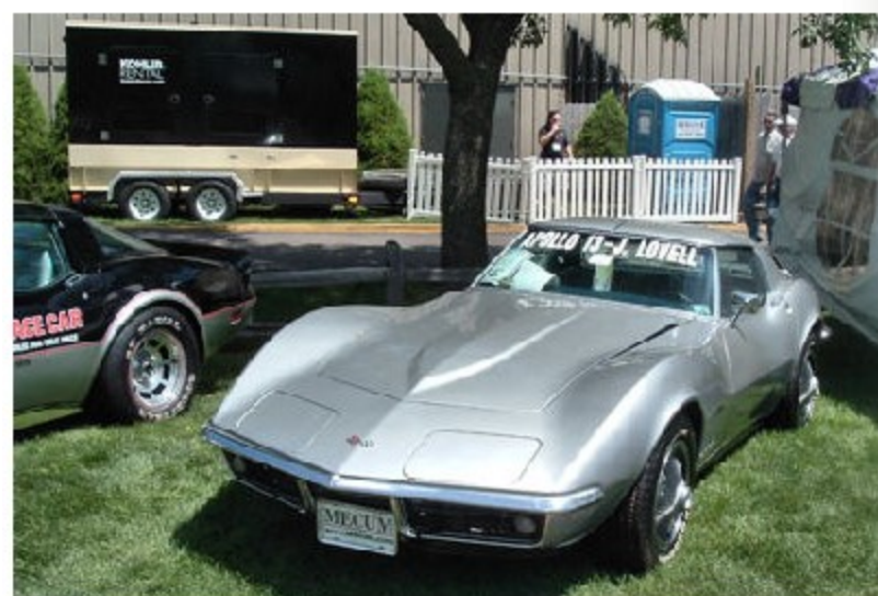
Apollo 13 Astronaut Jim Lovell's personal Corvette was sold at the Mecum Auction.

reserve price that he/she has established, or despite the down economy, he decides to take the reserve off. The auction was surprisingly well attended (you may have seen it broadcast on local cable TV channels) but bidders were looking for bargains which resulted in only about 125 of the auction cars being sold.