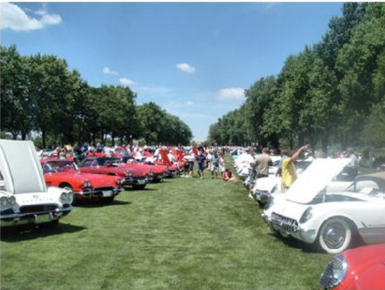
A big crowd gathers for the judging competition.

experience judging local, regional, and national Corvette events and competitions.