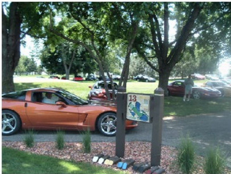
There's a little backup on the 13th tee!!!

But there is no golf allowed at Pheasant Run during Bloomington Gold, because the golf course provides the setting for one of the Midwest's largest Corvette events! General guest parking is limited to the outer golf holes, while Corvette owner-guests and competitors and auction Corvettes are parked on the interior golf holes. Access to the inner golf course is accomplished by using the golf course cart paths!! Imagine al-