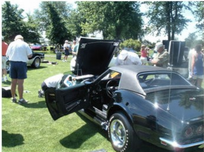
Another view of the car being judged on the previous page

A total of 120 Corvettes were entered into the Bloomington Gold Competition, and 59 were entered in the Survivor Competition, with many cars entered in both competitions. Of that total, 101 were judged as Bloomington Gold, 44 were judged as Survivor, and there were a total of 22 Benchmark vehicles.