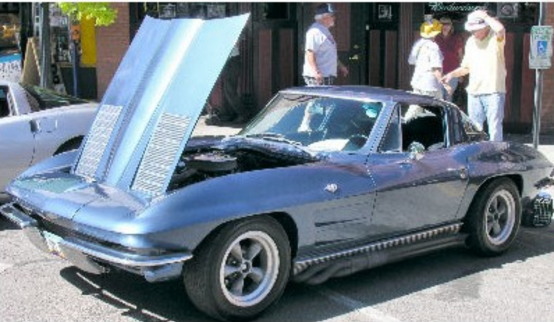
Another blue 63 - just not as blue....