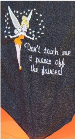
Flag Displayed over a C6 at the Tombstone Car Show