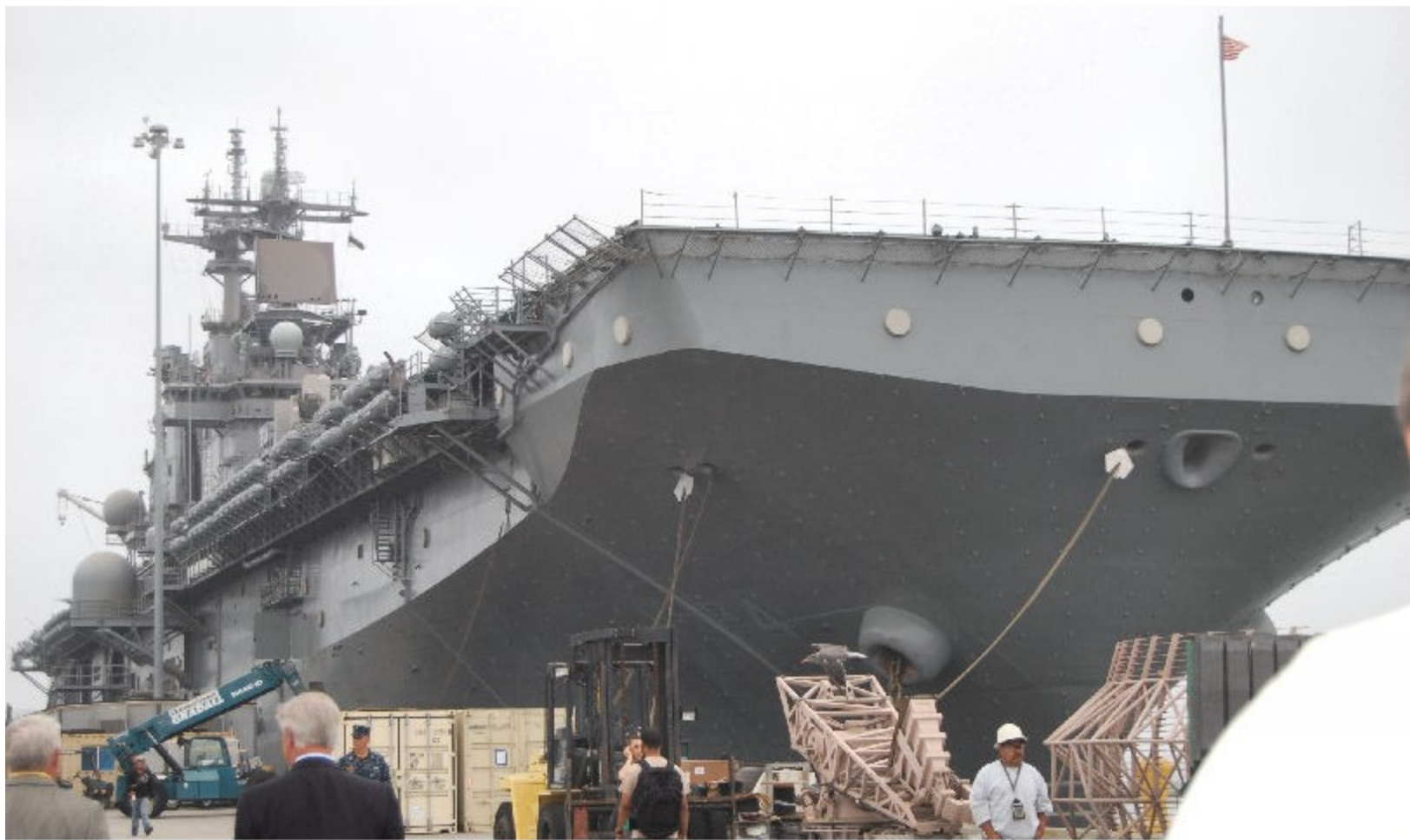
The Makin Island is one of four Multi Purpose Amphibious Assault Ships based in San Diego and is the newest and largest amphibious ship in the world. The LHD mission is to conduct prompt, sustained combat operations at sea, as part of the Navy's amphi-