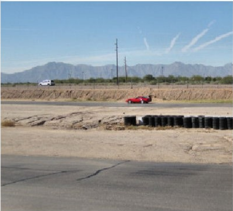
Michael's Vette on back straightaway