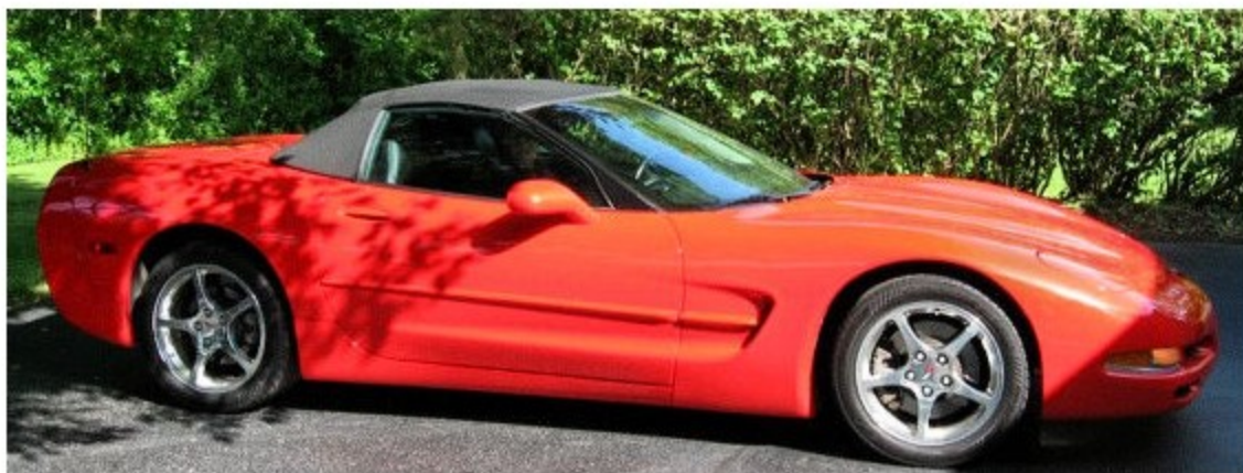
2002 Red Convertible