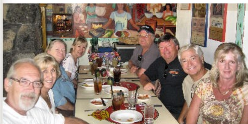
Lunch at El Chorro in Tucson