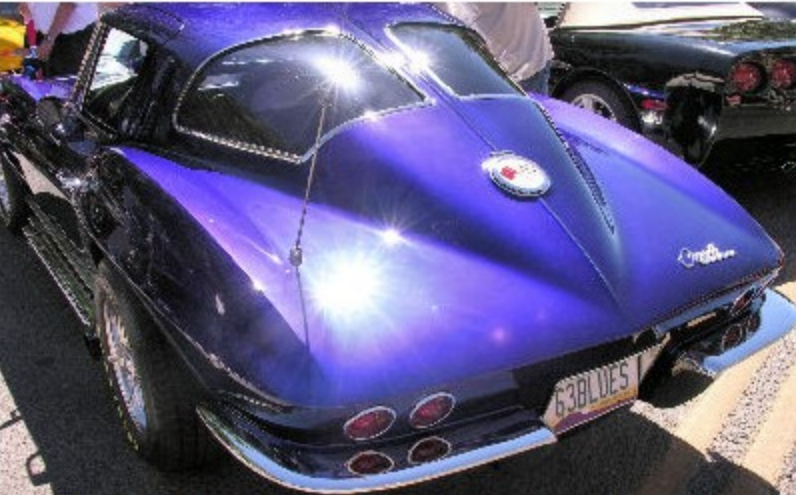
Click on the license plate to see a close up, and to get another glimpse of the depth of colors in this paint job!