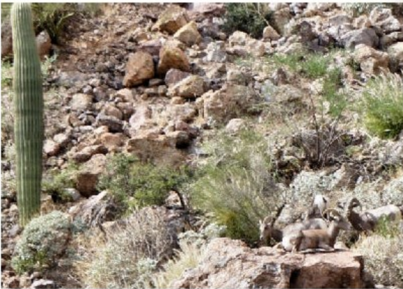
Click on the photo to see a larger view of the bighorn sheep in the lower right corner.

us on a 90 minute cruise of the lake. The scenery was breathtaking . Our captain recounted some of the legends and lore about the Superstition Mountains and we were fortunate enough to spot several Bighorn Sheep and even a Peregrine Falcon .