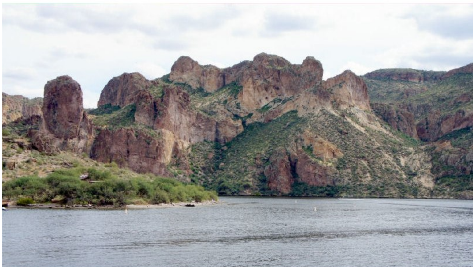
The beauty that is Canyon Lake