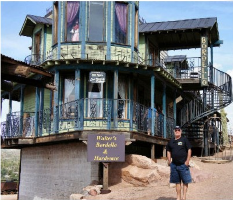
Check out Walter's Bordello & Hardware!

The town is a replica of an old mining town complete with a train, mercantile, restaurant, church, mining camp and even a bordello. There were lots of shops selling various trinkets and we all meandered through the main street to check it out. Once we had seen enough, we got back on the highway and headed towards the Apache Trail.