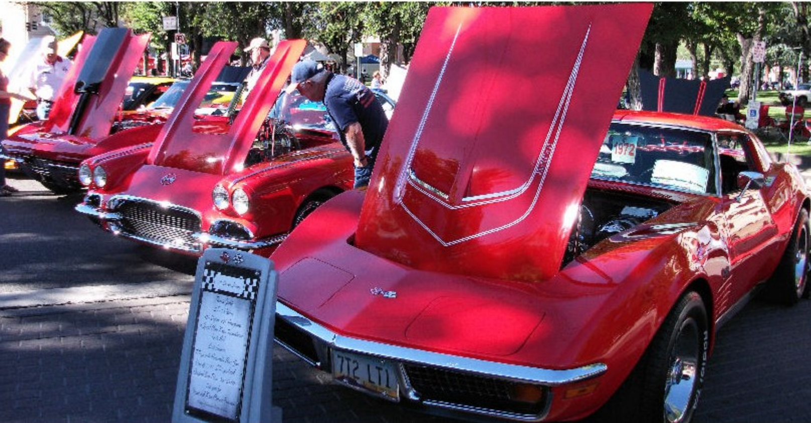
Here's some more older Vettes that were in the show. If you would like to see the reason for the cut-out hood on the middle car, click on its hood to see the "blown" mechanicals.