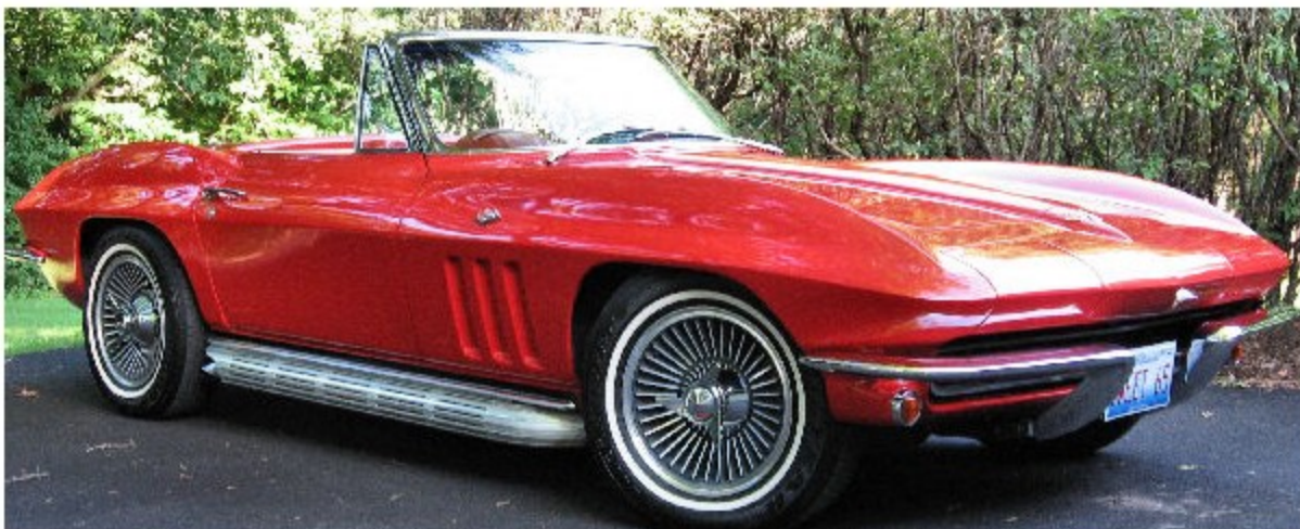
1965 Red Roadster