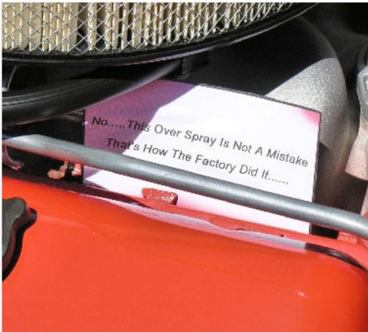
Check out this sign on an old Vette.