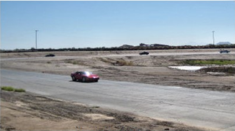
Mike heading for Turn 1