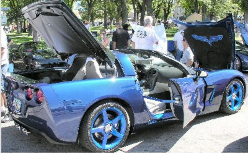
And talk about Blue! Here's a VERY BLUE C6!