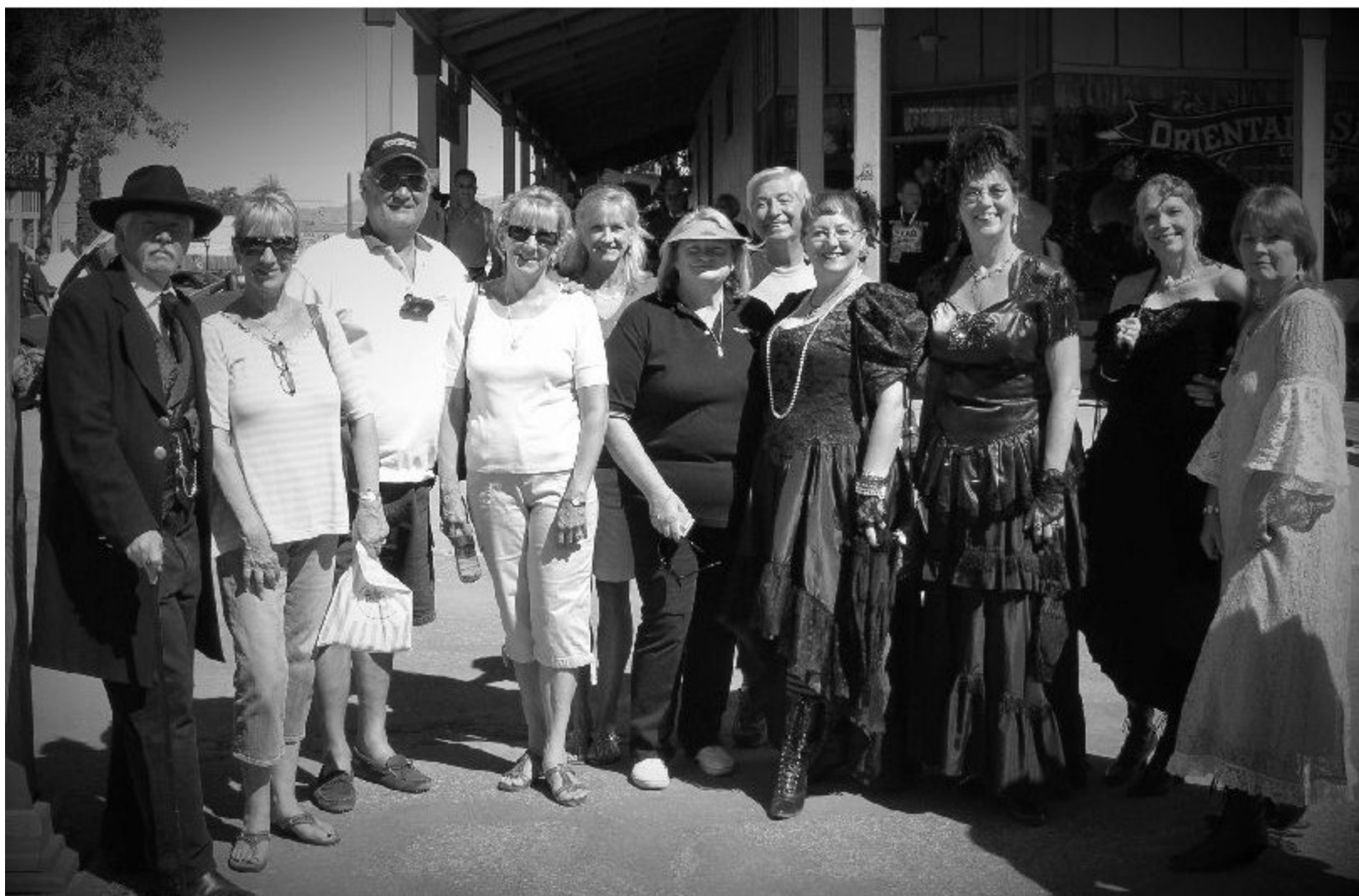
Here's the group with some of the local stars of the Gunfight at OK Corral