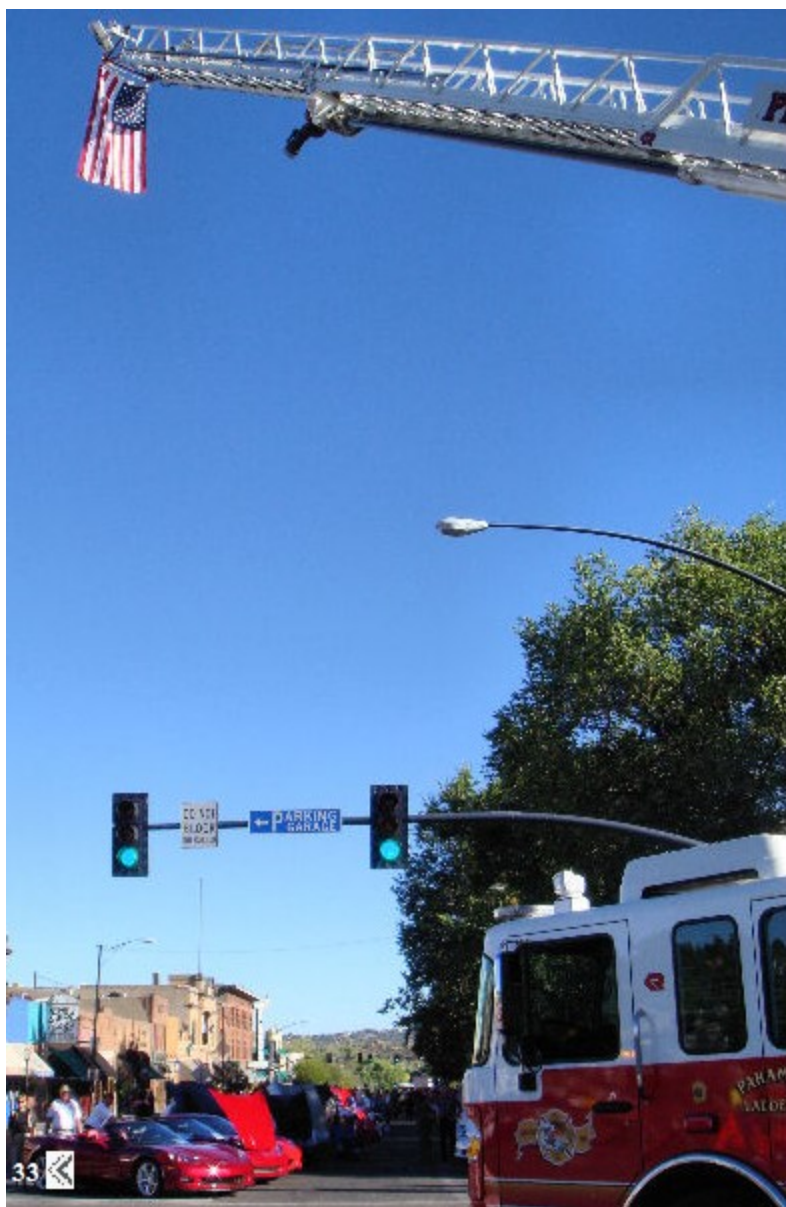
Prescott Corvette Show