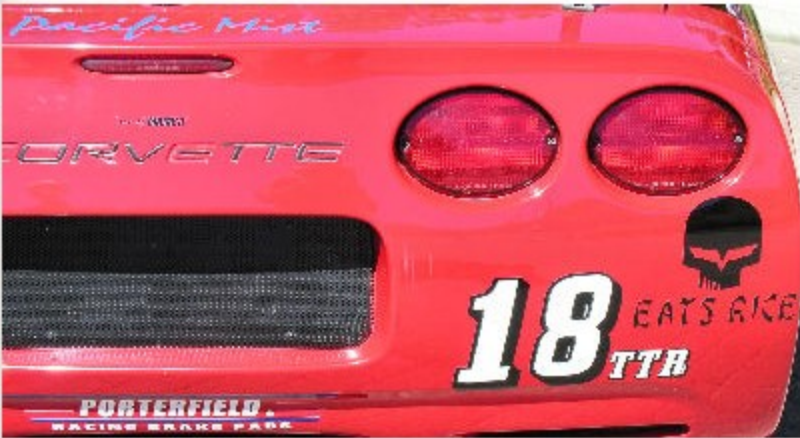
As you can see, there was a little bit of everything at this car show, including this C5 racer emblazoned with 'EATS RICE'.