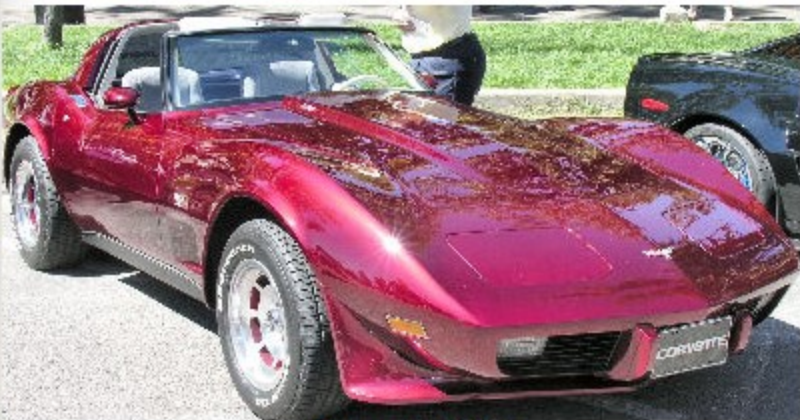
A beautiful C3