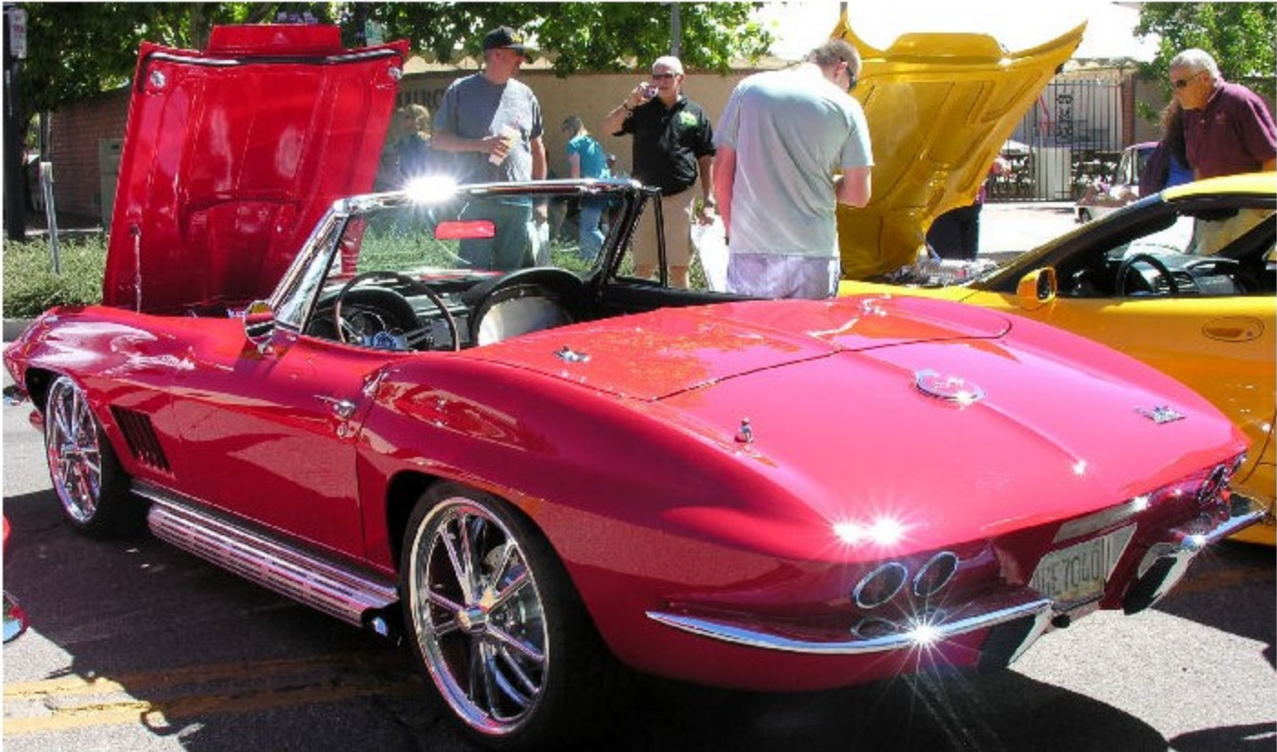
One gorgeous custom C2