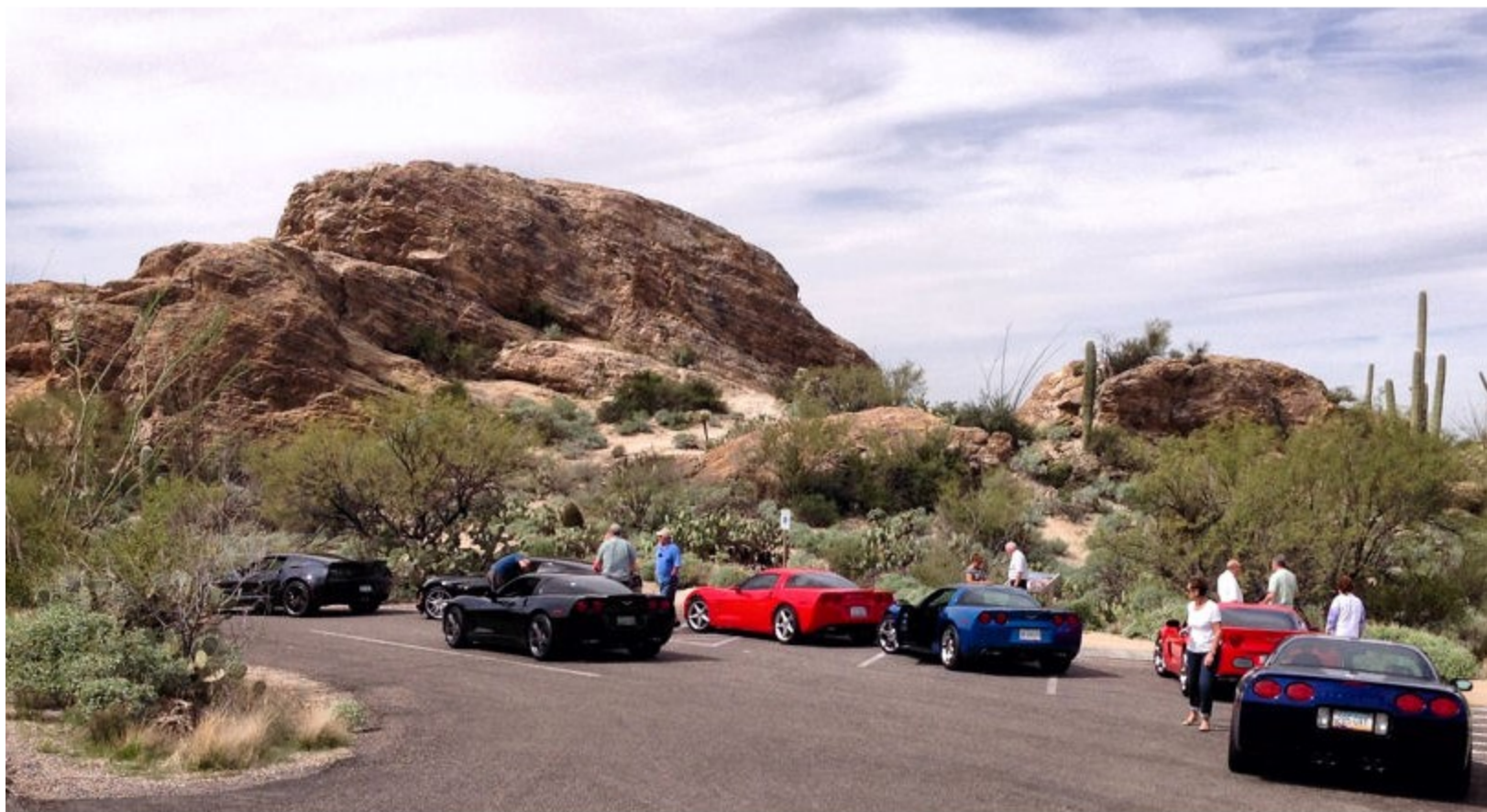
Seven Vettes at Saguaro National Park