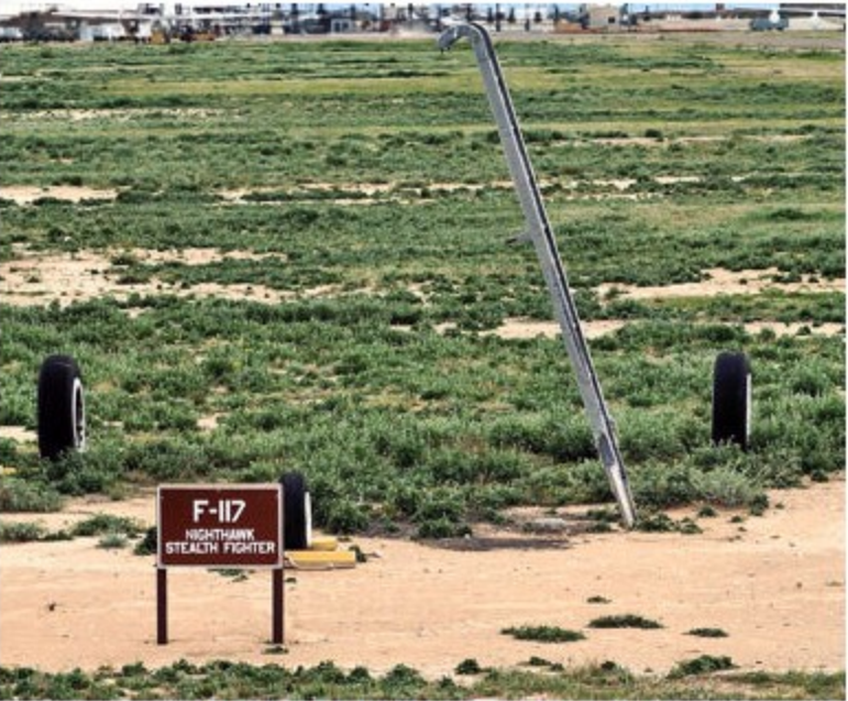
A little humor in the Boneyard

We then proceeded on to a 75-minute Tram tour taking us through the Boneyard of 4000 retired aircraft on the fields outside the hangars.