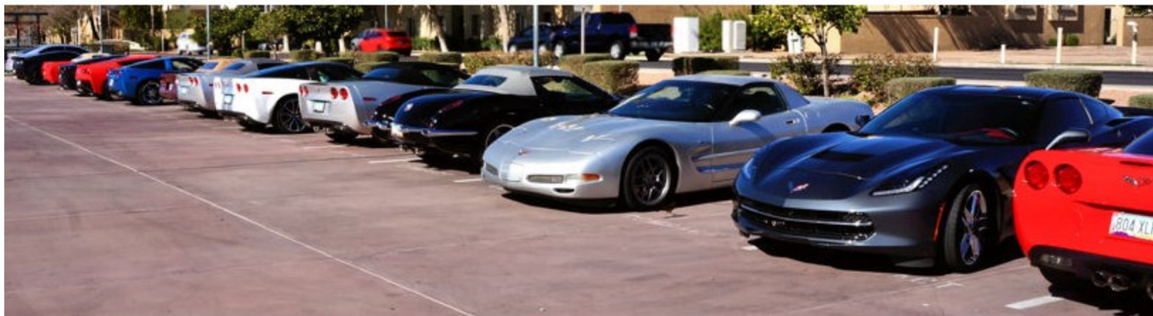
This was the scene in the parking lot at the Chinese Cultural Center. A lotta fine lookin' Corvettes!!