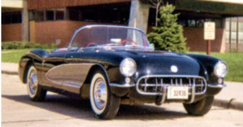
1957 Corvette at Jefferson High School, Spring 1960

Then in May 1960 I was in an accident coming back from a wedding party very late at night and literally demolished the entire front end of the Corvette. The Corvette sat at the Chevrolet dealer until August 1960 as they were getting parts and trying to figure out how to repair it. They had never repaired a Corvette to that extent of damage before. Then in August 1960 I was approached by an engineer at Collins Radio who offered me a reasonable price for it - "as is." He felt he and his friends would be able to repair it. With the reimbursement from my car insurance and the selling price, I essentially broke even - very fortunate. The Corvette was a fun car in so many respects, but not for an 18-year-old.