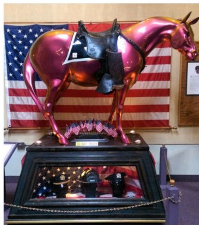
The 9-11 Memorial Pony