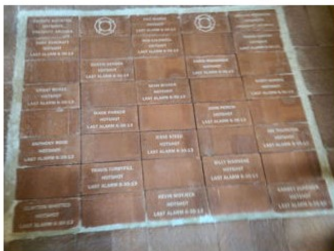
Brick Memorial to the Yarnell Hot Shots