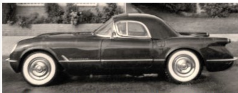
1954 Corvette in Long Beach after purchase, October 1962

would help me. She also agreed to pick me up at the Greyhound Bus Station in Las Vegas as I would have to take a bus to get there. It took us about a half hour to get the Corvette started. I paid her and took off. The Corvette, originally blue, had been repainted a deep maroon lacquer, and the paint was all checked and much of the paint had cracks and breaks. The car had both the convertible top (totally rotted out although the framework was good) and an aftermarket hardtop. The leather seats were the original tan but pretty well torn in the middle section. I got it back to Long Beach, and it just died there. After about 2 weeks I had gotten the parts I needed from junk yards and with a lot of work got it back to running condition. All the chrome was in rough shape, and the plastic windows were not very good.