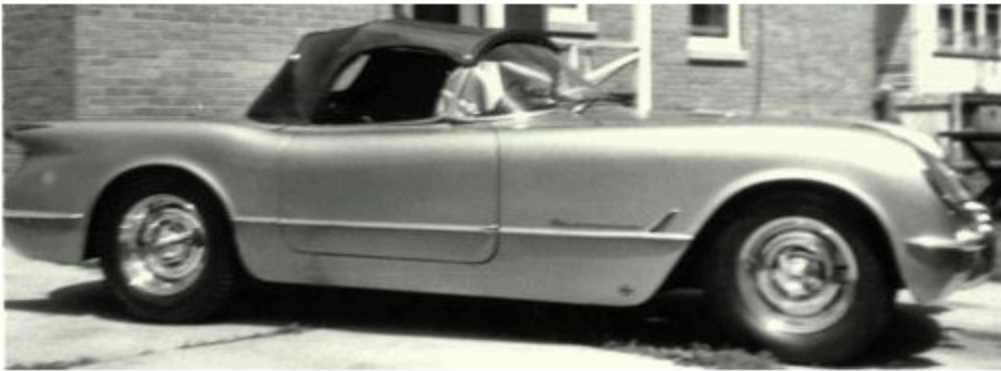
1954 Corvette - Milwaukee, just before sale