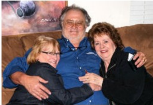
A Thorn Between Two Roses

The next day, after breakfast, 7 cars and 11 people proceeded to Saguaro National Park. A brief delay entailed and closed the road for about 20 minutes. Enough time to get out and stretch. Back in the Vettes the driving tour began. A scenic loop at different elevations allowed us to see the wilderness area and preserve. This 5-mile trip had a dense saguaro forest we could see from a