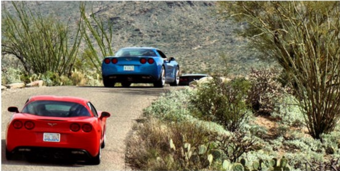
Saguaro National Park

The next day, after breakfast, 7 cars and 11 people proceeded to Saguaro National Park. A brief delay entailed and closed the road for about 20 minutes. Enough time to get out and stretch. Back in the Vettes the driving tour began. A scenic loop at different elevations allowed us to see the wilderness area and preserve. This 5-mile trip had a dense saguaro forest we could see from a