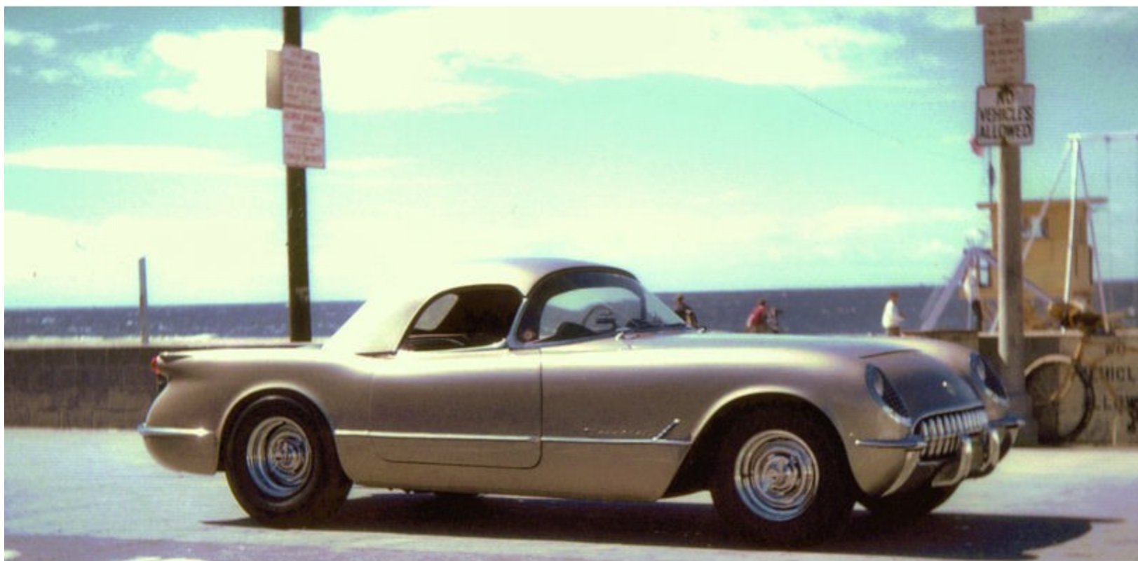
1954 Corvette - Hermosa Beach Strand in Spring 1963