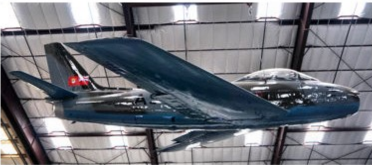
In the Pima Air & Space Museum

Of course, after all this knowledge and since we are a "drive and dine" club, it was time for yet another nice lunch. This one was at the Museum in The Flight Grill.