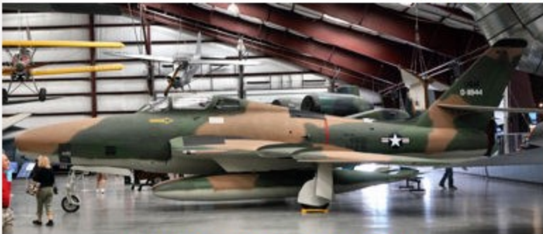
In the Pima Air & Space Museum

We then proceeded on to a 75-minute Tram tour taking us through the Boneyard of 4000 retired aircraft on the fields outside the hangars.