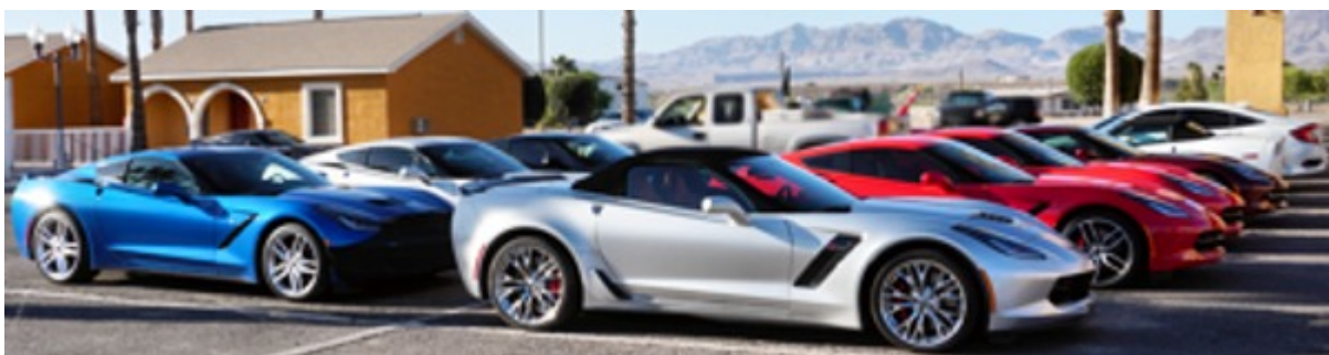
Corvettes and Honda at the Quality Inn

On Saturday morning, we all enjoyed the complimentary breakfast at the Quality Inn before packing up and heading towards Clifton in single file. In Clifton, we overwhelmed a gas station where some filled up,