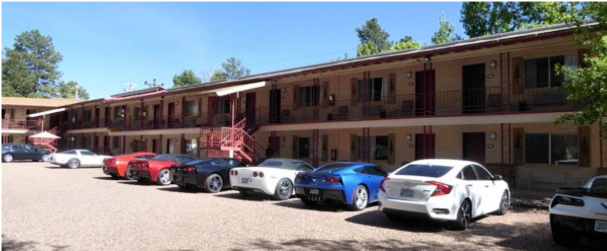
The gang's all here - at the Antlers Inn in Pinetop