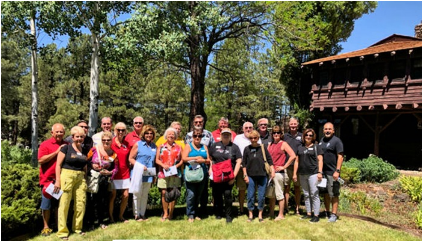
Our group in the gardens at the Riordan Mansion