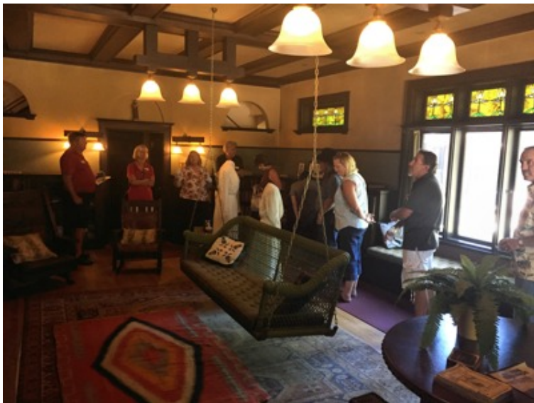
A wicker swing in front of the fireplace