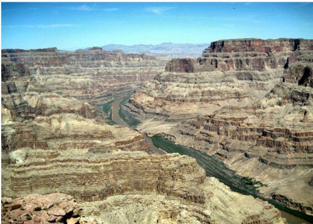
The view from the Skywalk