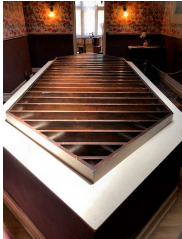
The ingenious air flow/skylight system, viewed from downstairs at left and from upstairs at right, was designed to make the most of the electric heating system