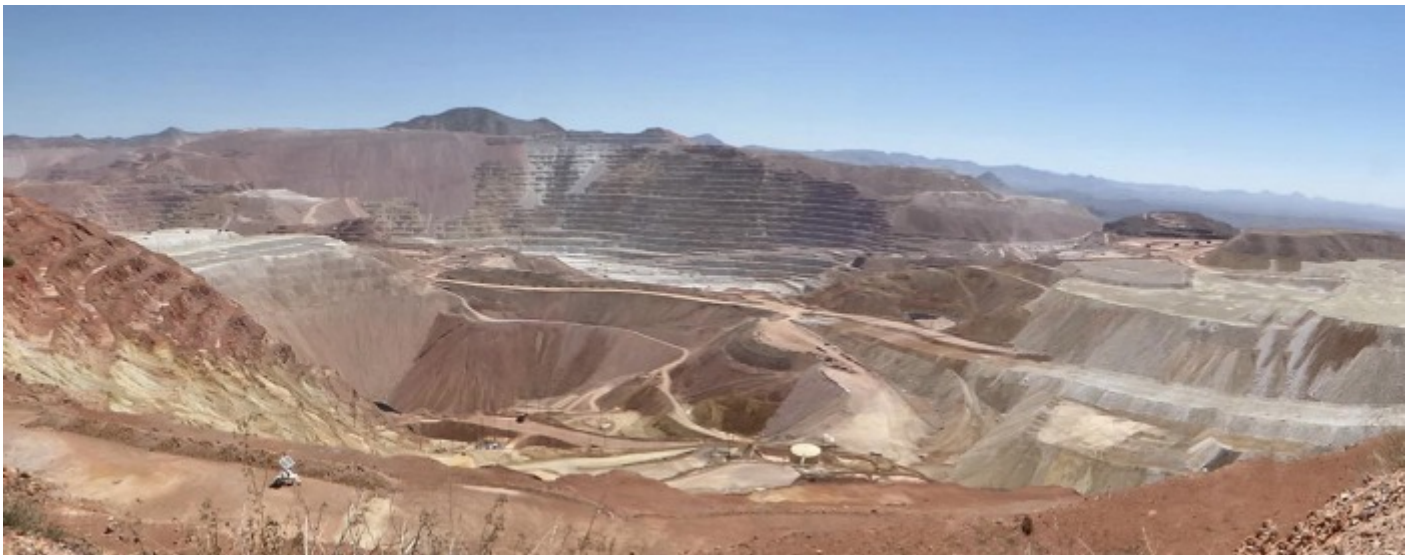
Morenci Mine, the largest copper mine in North America