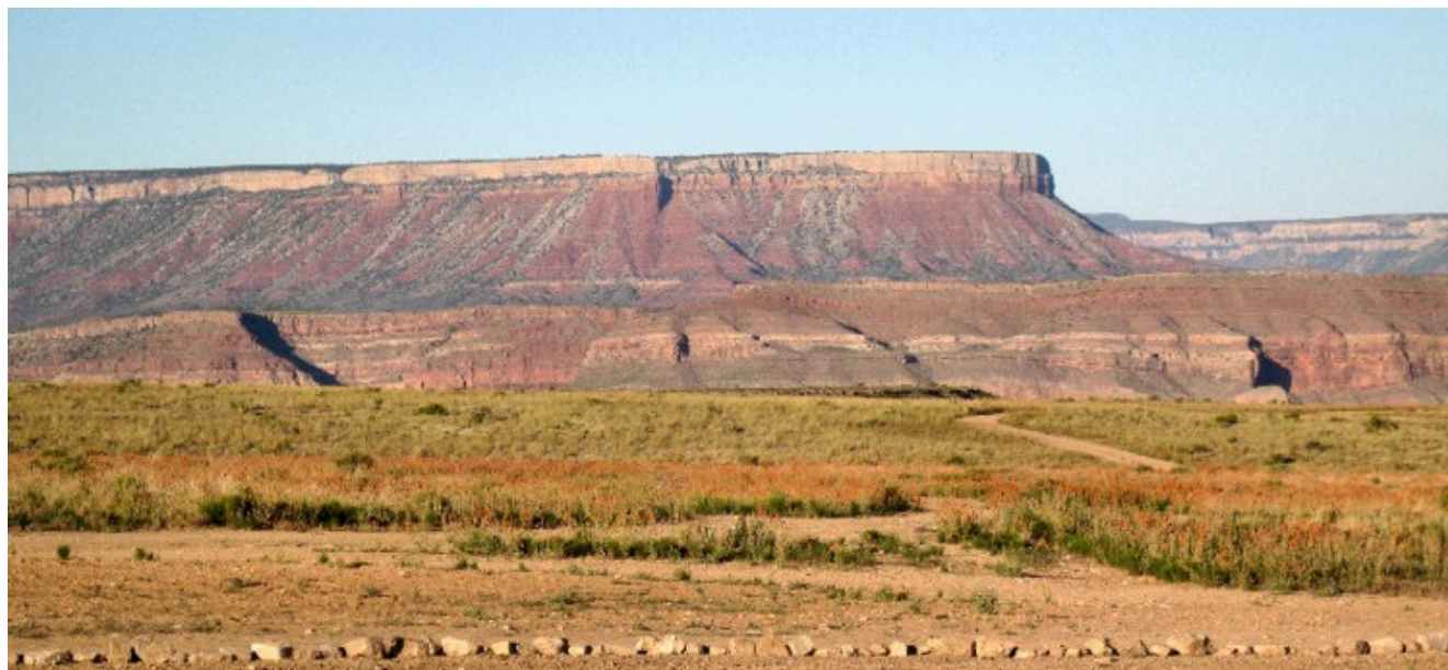
The View from Grand Canyon West Ranch