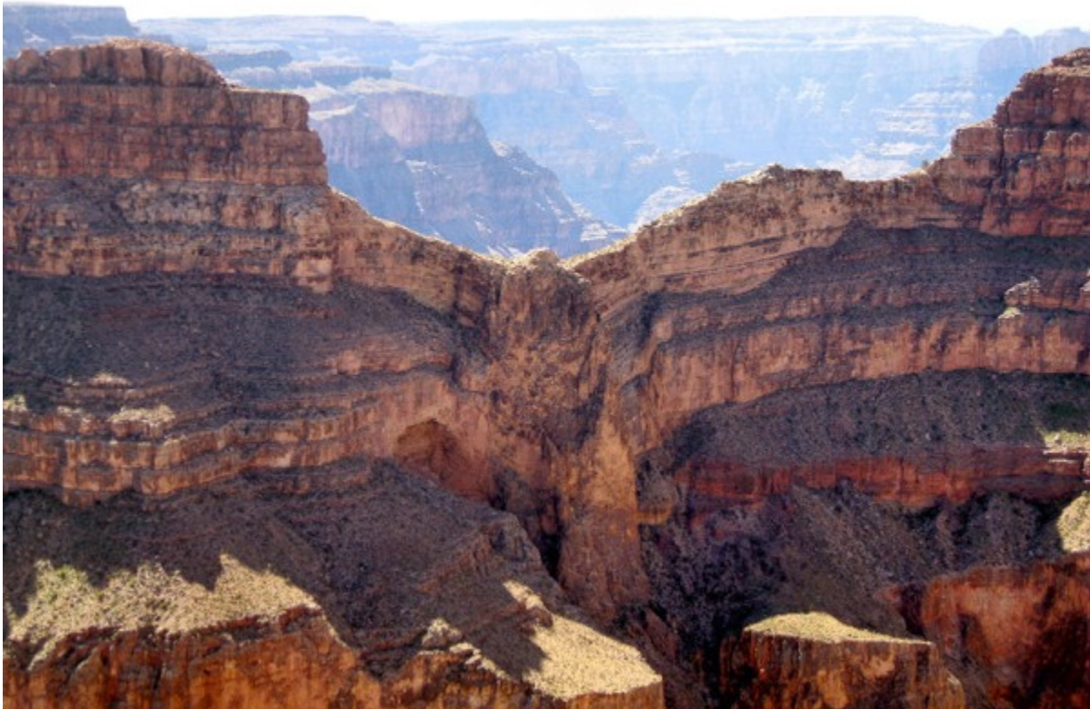
This formation is called Eagle Rock. At left is an enlargement of the "eagle" at the center of the photo.

We ate lunch at the Skywalk, and then headed back to the gateway where our van awaited to take us back to Dolan Springs.