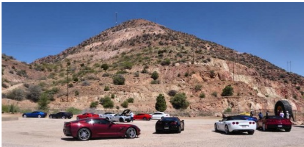
Everyone resting in the overlook staging area. That would be SUZZETE the Corvette in the front waiting to go first