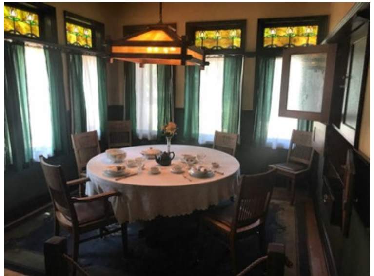
The breakfast room with Stickley chairs

The Riordan Mansion has 40 rooms and seven bathrooms, and construction cost in 1904 was about $90,000. The wicker swing pictured above could face the fireplace in winter and then be reversed to face the windows during the summer. The home was equipped with a telephone and open floor plans.