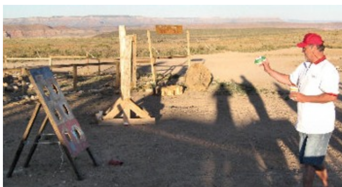
Walter tries to throw small football through hole - any hole - in board!