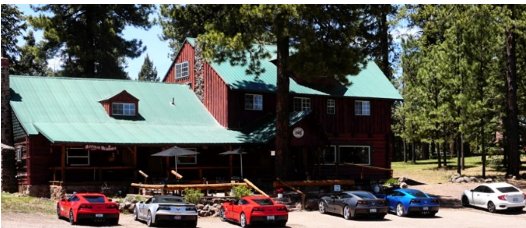
Here's the performance group waiting at Hannagan's Meadow for the leisure group