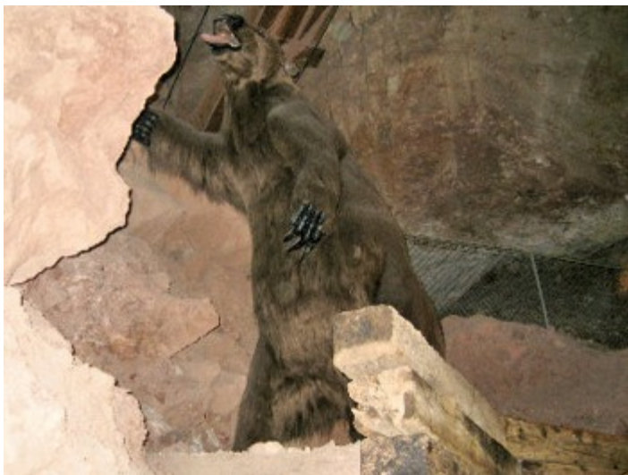
The sloth in Grand Canyon Caverns

Later we all gathered for cocktails in Dawn and Manny's room, and ate dinner in the Hualapai Inn's dining room.