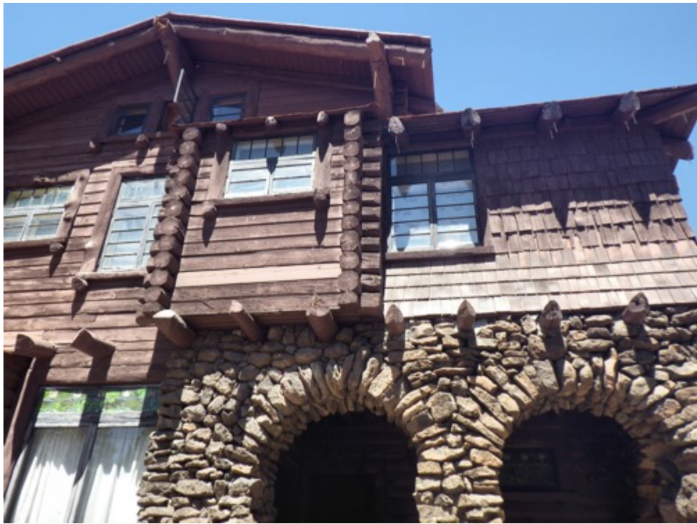
The stone gateway in front of the Mansion; the above photo shows some of the materials used in construction: logs, shingles and stonework