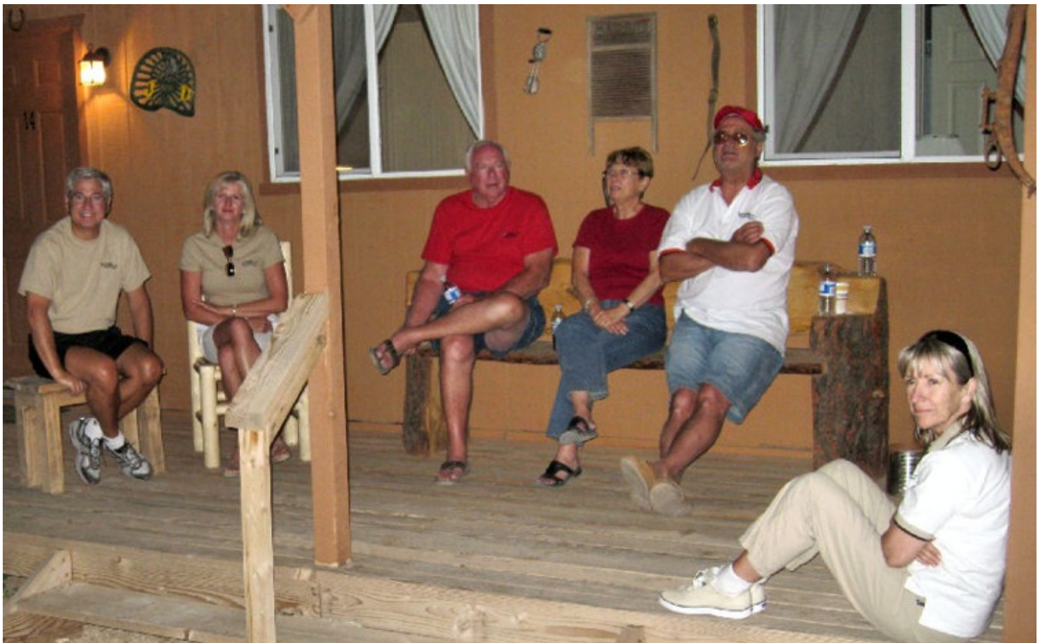
Here we all are, relaxing after dinner at the Ranch