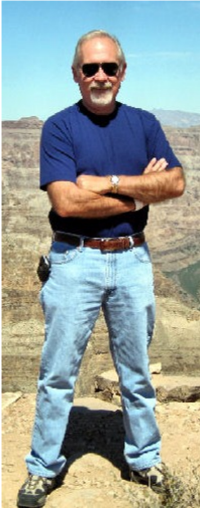
Guys on the edge