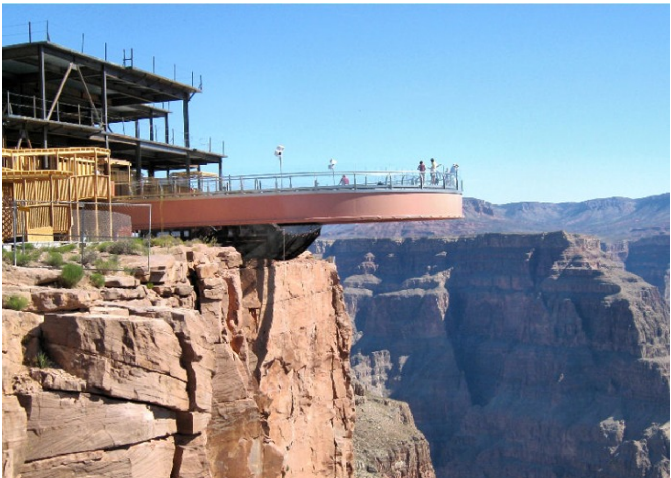
The Hualapai Indians are building a hotel and a restaurant to the left of the Skywalk

hanging out over the chasm as the advertising would have you believe. It was fun to walk out on it and look down at the rocks underneath, but there was no mile deep chasm under the Skywalk – just the rocks forming the edge of the Canyon. The Canyon is particularly beautiful in this area, with many formations, and a wide expanse of the Colorado River is visible from the Skywalk.