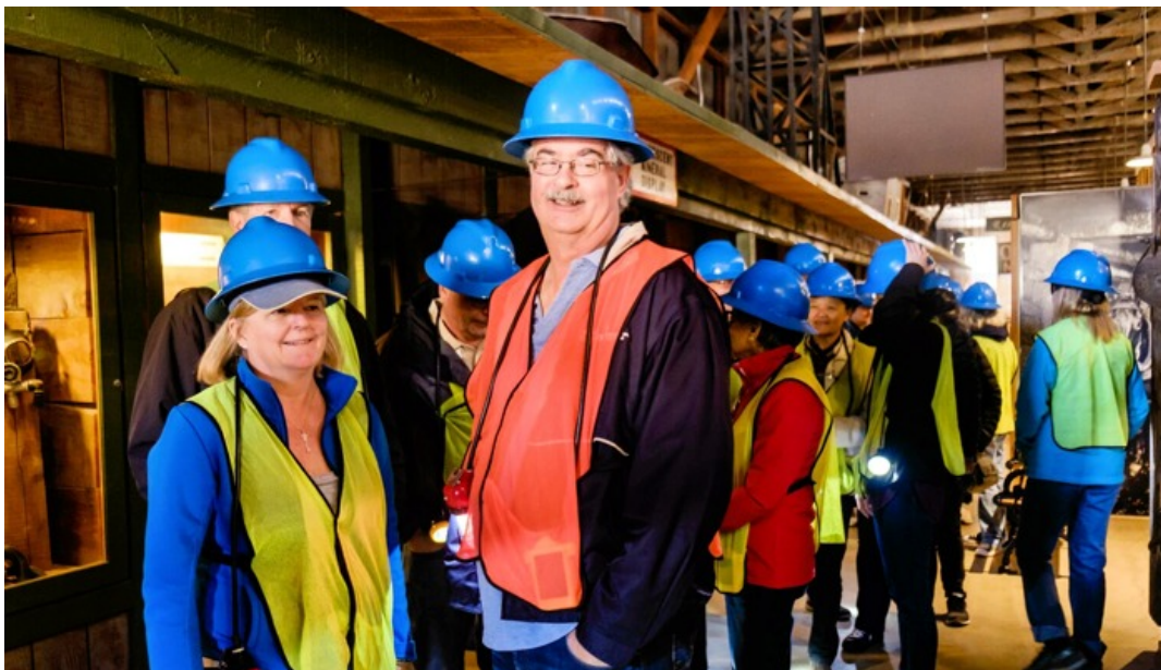
SCC members in their mine outfits