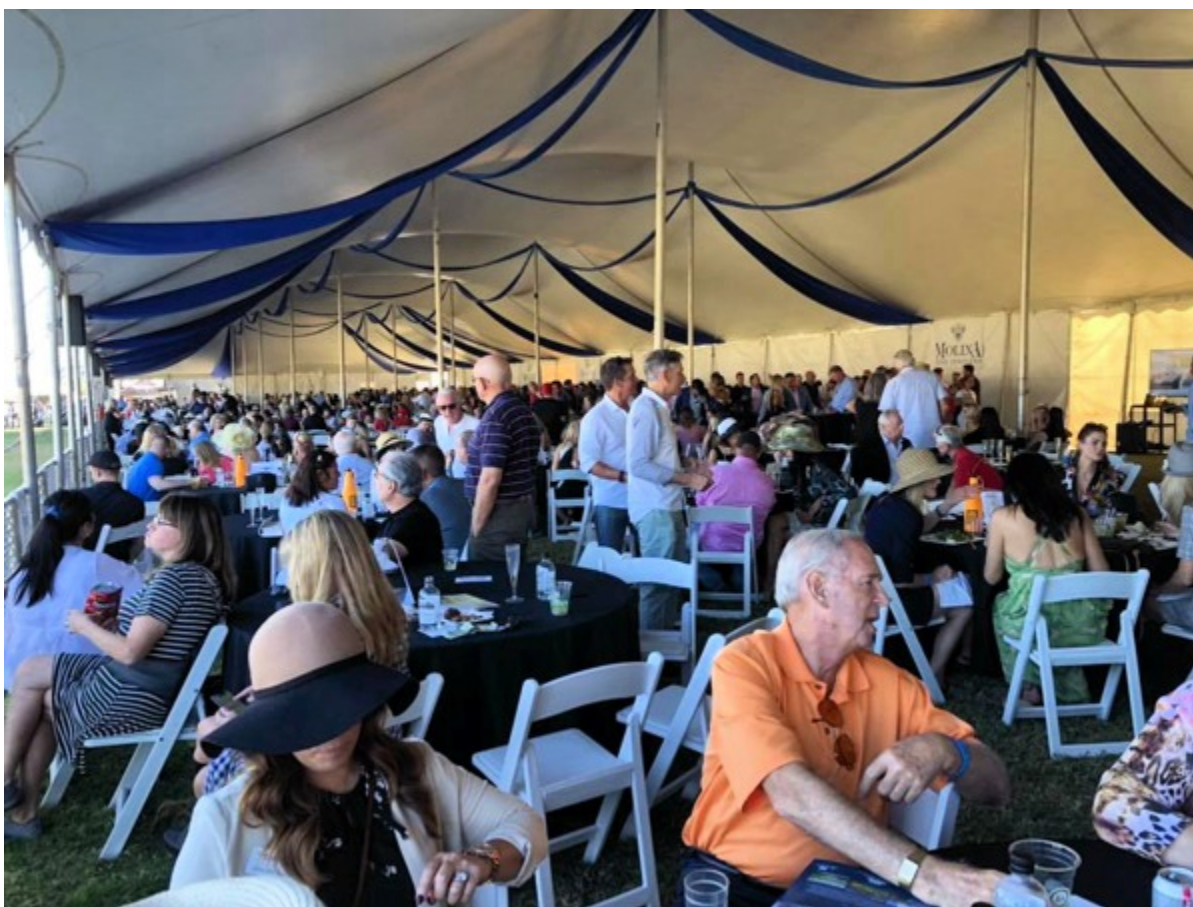
The scene in the Molino Jewelers tent: