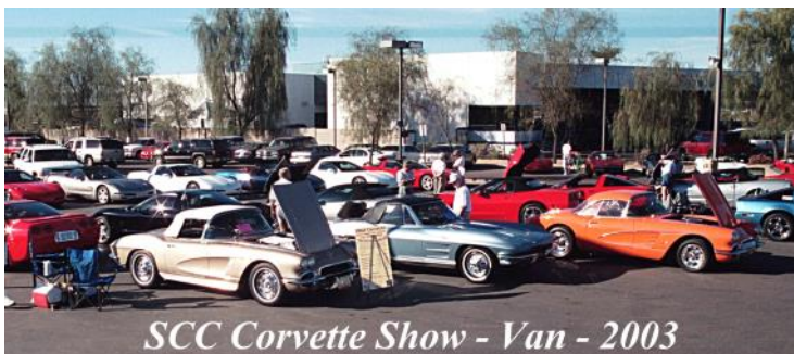
SCC Corvette Show - Van - 2003