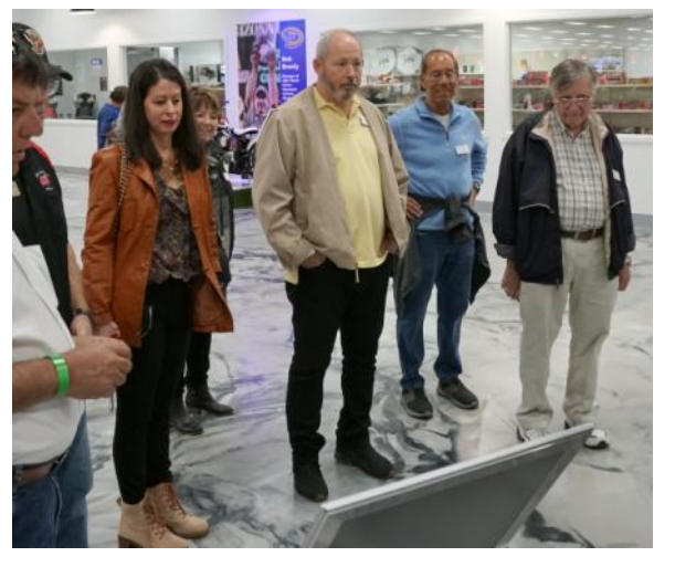
Admiring the Cobra

At noon after a group photo we departed for the restaurant. Some rain drizzle was incurred along the 10 minute drive. At the restaurant we enjoyed a private dining room with roaring fireplace. Members could choose from 5 different entrees for their meal. Everything was delicious and the portions so large many left with a doggie bag. The skies did open up while we ate but thankfully the Sun was out by the time we left. All in all, it ended up being a perfect (rainy) day for a museum visit with all our Club friends.