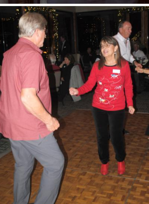
Let there be music and dancing!!