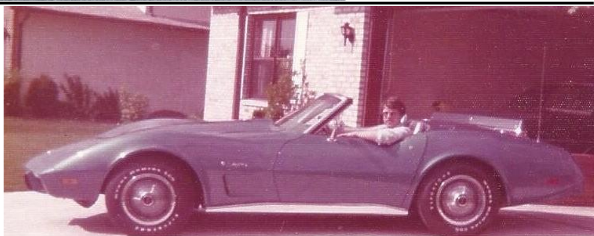
Recognize this SCC member? First one to email the answer wins a prize (of little or no value)

If interested, send me your photo entries and comments by mid-February. <u>wmbales@gorvw.net</u>